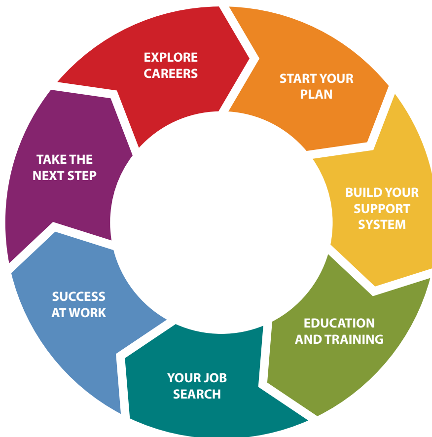
Career Planning and Development

Reaching your career goals involves many phases and can be viewed as a cycle rather than a straight path. The chapters of this guide are based on the cycle shown below. If you want to make a career decision, start by exploring careers that interest you. At any time in your life, you may find yourself at a different point in the cycle, so you can go straight to that section of the guide.